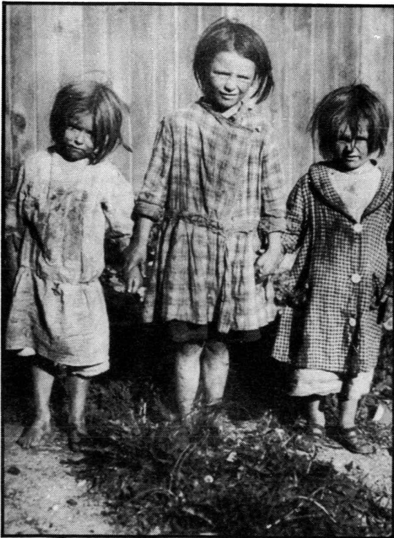
THE "POOR," Courtesy of the Public Archives of Canada, PAC118221.

This is not to say that annual reports or speeches at public meetings did not contain the predictable Christian sentiments and emphasis