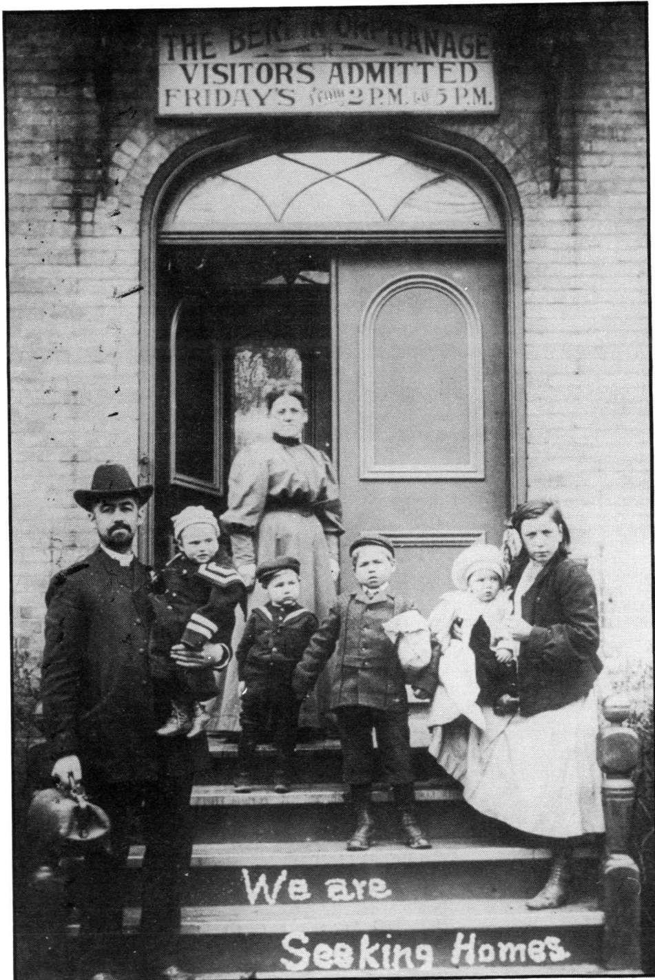
"WE ARE SEEKING HOMES,"